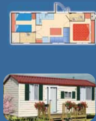
Mobile-home - 4 People