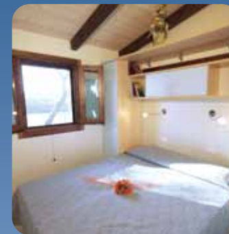
Bungalow - 3 People "natura" - "comfort"