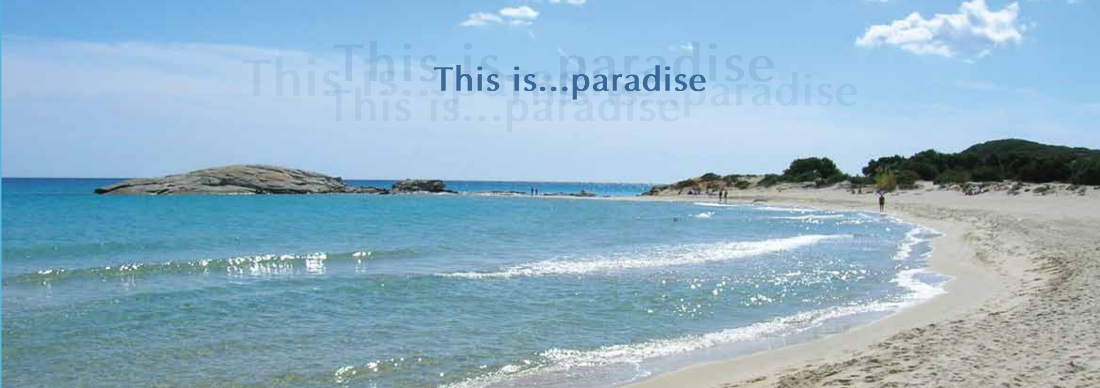
Our beach and "Peppino" rock

This is...paradise This is...paradise This is...paradise