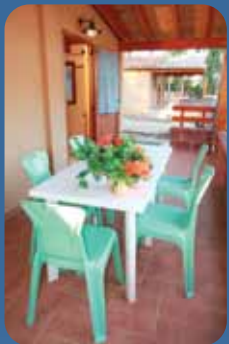
Bungalow - 4 People "free"