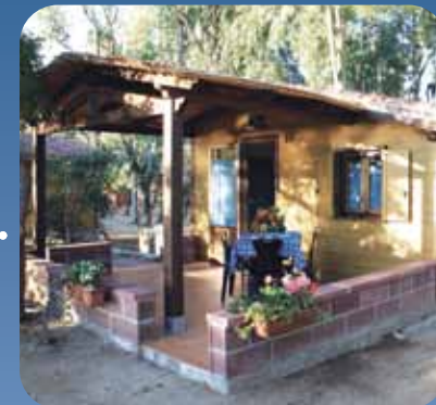
Bungalow - 4 People "natura"